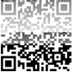
Scan for digital resource