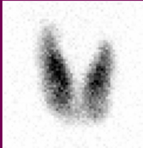
Thyroid Scan Image

I-131 (30-200 mCi) is administered to destroy thyroid cancer cells.