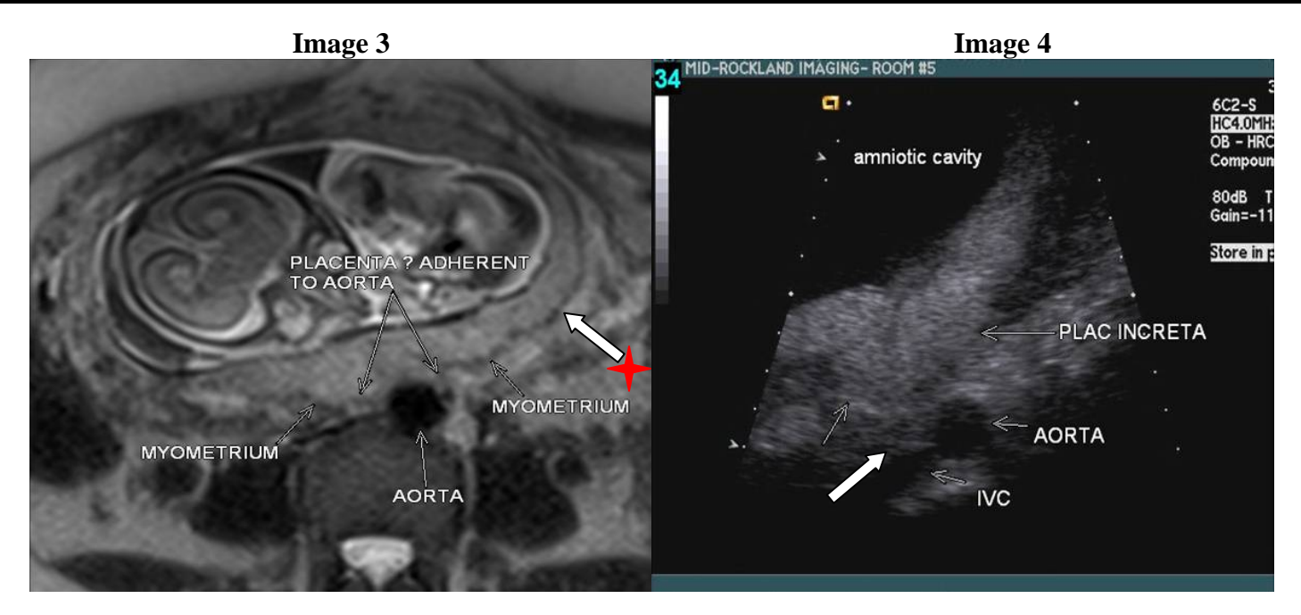
Case Study 2: At 24 weeks- sudden pain, uterine rupture requiring hysterectomy. Path- Deep increta with microscopic percreta. Image 3 (MRI) = placenta. Image 4 (ultrasound)- Thick white arrow denotes intact tissue plane separating placenta from aorta. Note focal exophytic bulge of placenta = increta.