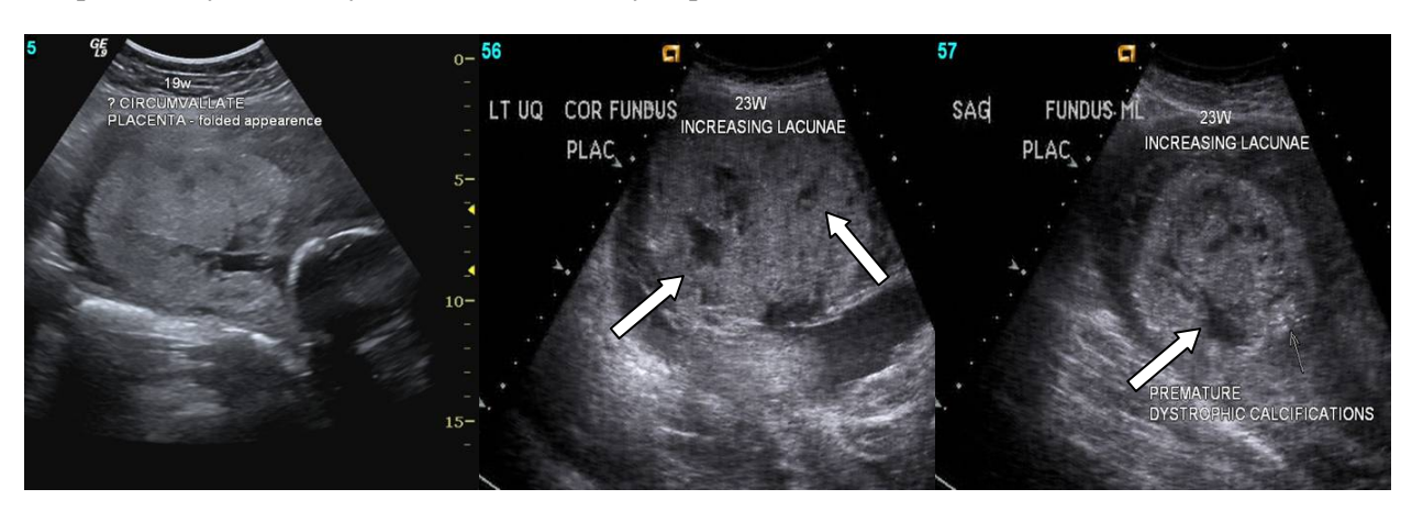
Case Study 3: Arrows= lacunae. Note increasing number between 19 weeks and 23 weeks. Lacunae are irregular and ovoid. Placenta increta can occur in the absence of prior CS. Experience and vigilance allowed us to alert the OB to its possibility in this case. OB was prepared for possible hysterectomy, which was ultimately required.

Placenta increta/percreta can occur in the absence of prior C-section. Knowledge, experience and vigilance allowed us to alert the obstetrician to its possibility. The obstetrician was prepared for a possible hysterectomy which was ultimately required.